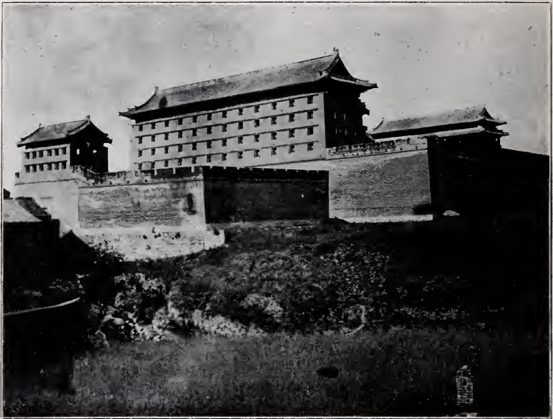
THE GATES OF SIANFU.

Many a time during my expedition has it been necessary for my men, my animals and myself, to seek the shelter of an abandoned cave against the terrible dust-storms of North China; and once I slept in a cave with a corpse in a black coffin as neighbor, while my men and beasts occupied the neighboring cave with the garde funèbre .